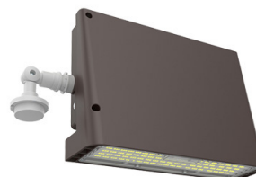
MS (External Microwave sensor)