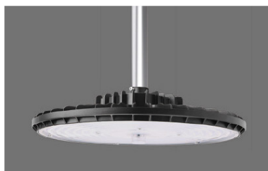
Conduit Pendant Mount