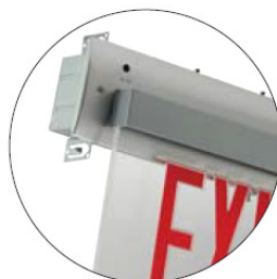
Wall mount option