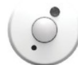
Ceiling Mount Occupancy/Daylight Sensor