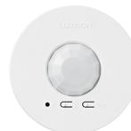
Ceiling Mount Occupancy Sensor