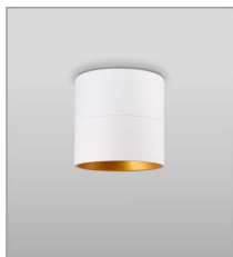
CM Surface ceiling mount to recessed J-box