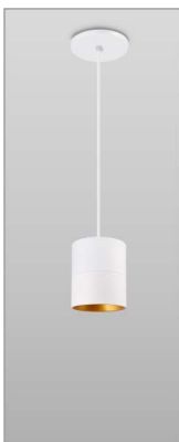
AC24, AC48, AC96 Pendant cable mount to recessed J-box