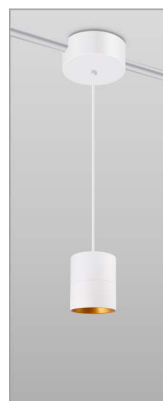
ACC24, ACC48, ACC96 Pendant cable mount to exposed J-box