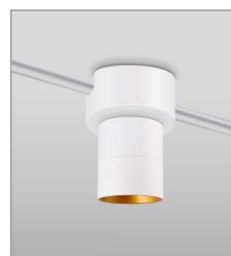
CMC Surface ceiling mount to exposed J-box