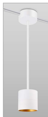
STC24, STC48, STC96 Pendant stem mount to exposed J-box